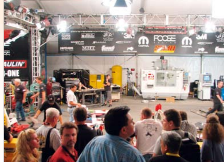
Overhaulin' live in Las Vegas

As part of a unique partnership, Kaeser evaluates each location's compressed air system providing a complete air assessment to confirm that it's capacity and air quality meet the necessary requirements. More often than not, Kaeser provides an SM series rotary screw compressor package with integrated refrigeration dryer, filtration and condensate drainage for the dura-