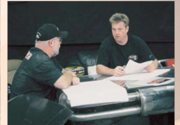
Chip Foose sketches out the interior and exterior of the car

tion of the build. These turnkey packages are pre-piped and wired for easy installation so that the team can get straight down to business and start overhaulin'.