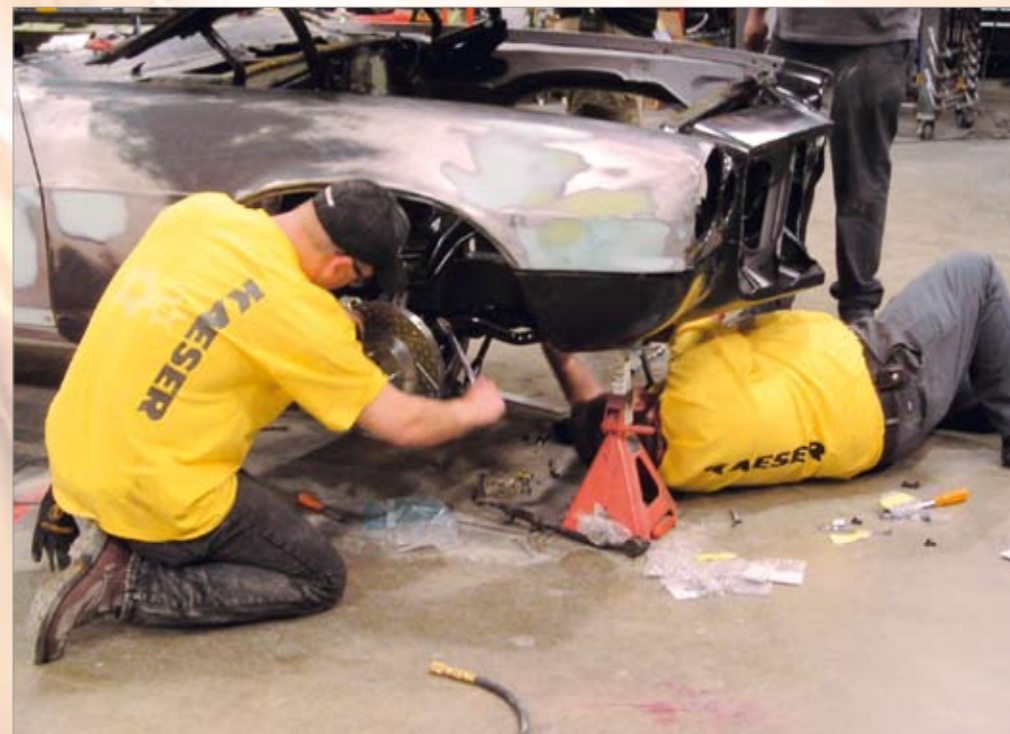
The car is stripped down to the metal and rebuilt from scratch

Once again, the A-team relied on Kaeser for all of the compressed air on set: An ASD 25 T rotary screw compressor package was used to power the CNC machining center, a high pressure water-jet cutter and a variety of compressed air hand tools, whilst a SM series turnkey system comprising an air receiver, dryer and filtration provided the dry compressed air for the paint spray booth.